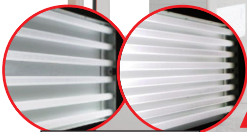
Optional 6-tube or 8-tube light fixtures available