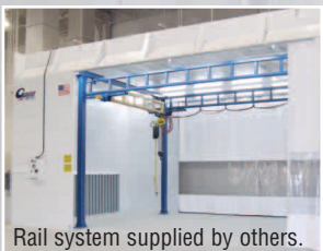
Rail system supplied by others.